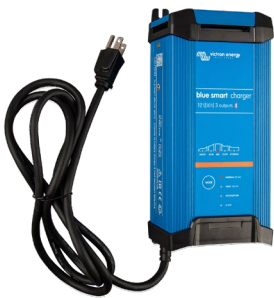
Blue Smart IP22 12/30 (3)